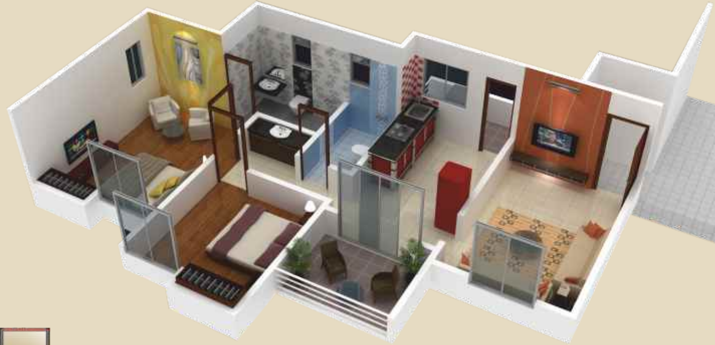
3D Cut Section View