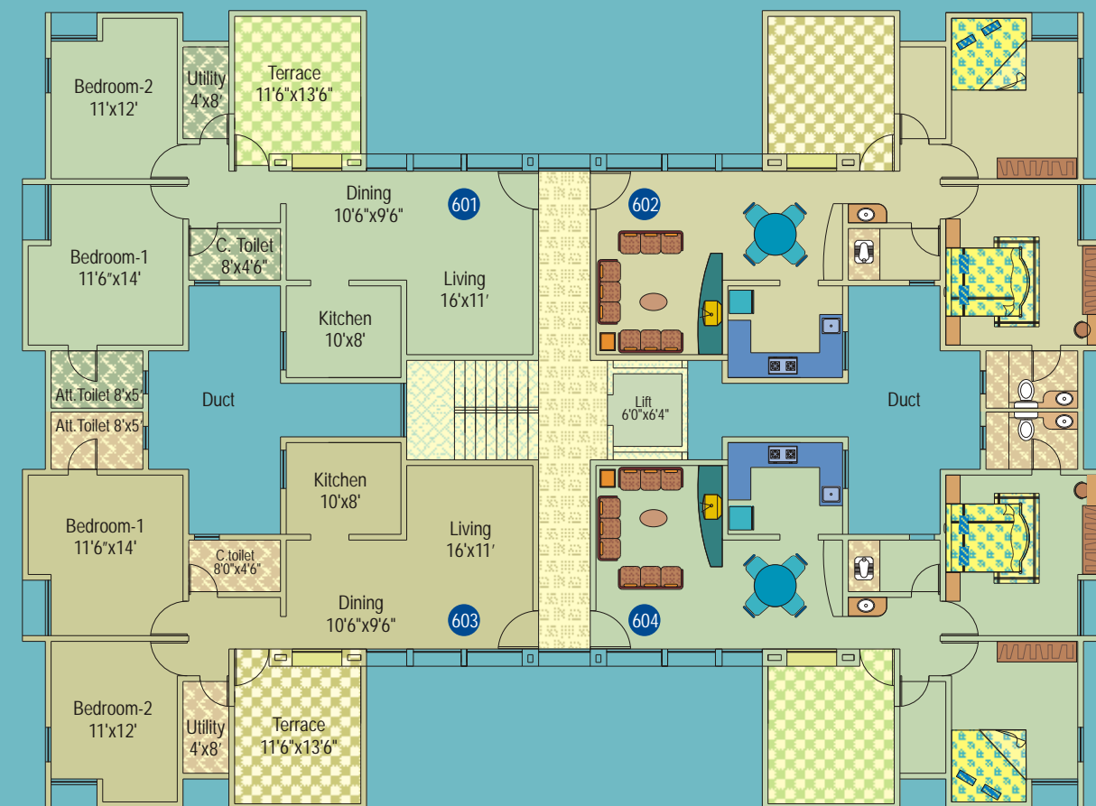
Sixth Floor Plan