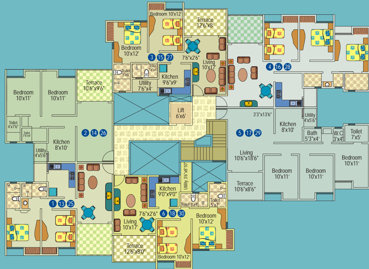
Typical First, Third & Fifth Floor Plan