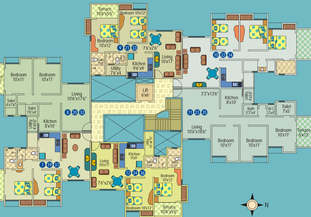
Typical Second, Fourth & Sixth Floor Plan