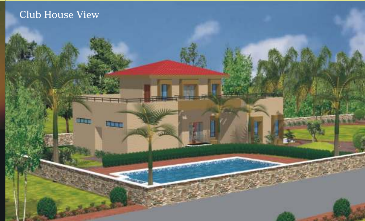
Club House View