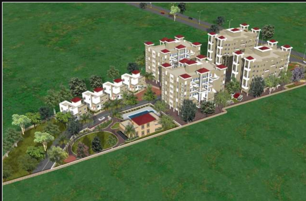
Bird's eye view of High Class Residency

Site: S. No. 344, Hissa No. 3A, 3B, 3C, Bavdhan Budruk, Pune. Tel: 020- 22953214