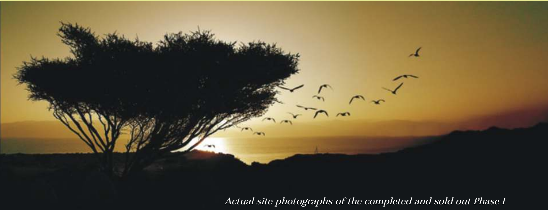
Actual site photographs of the completed and sold out Phase I